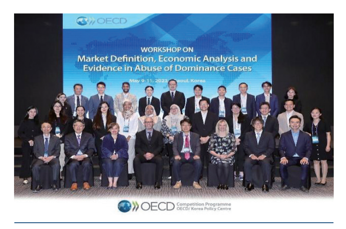
<OECD Competition Policy Workshop: Market Definition, Economic Analysis & Evidence in Abuse of Dominance Cases> May 9-11, 2023, Seoul

The Competition Programme introduces and disseminates OECD's best practices, advanced competition laws and policies to government officials and judges in the Asia-Pacific region.