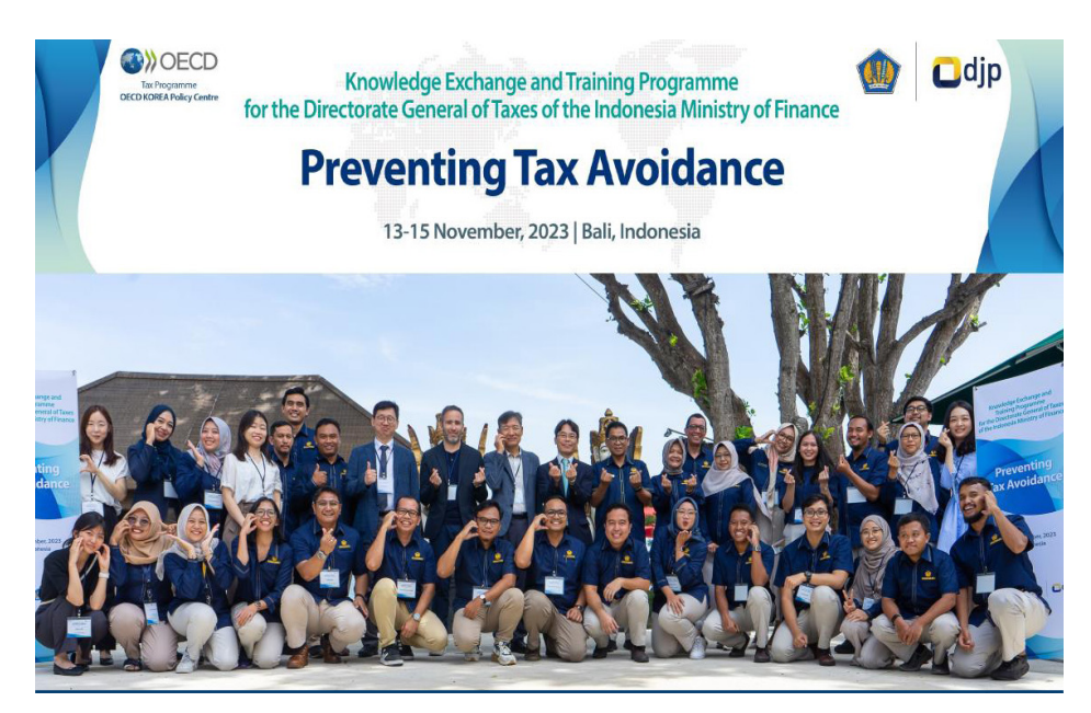
<The Directorate General of Taxes (DGT) Knowledge Exchange and Training: Preventing Tax Avoidance> Nov 13-15, 2023, Bali, Indonesia