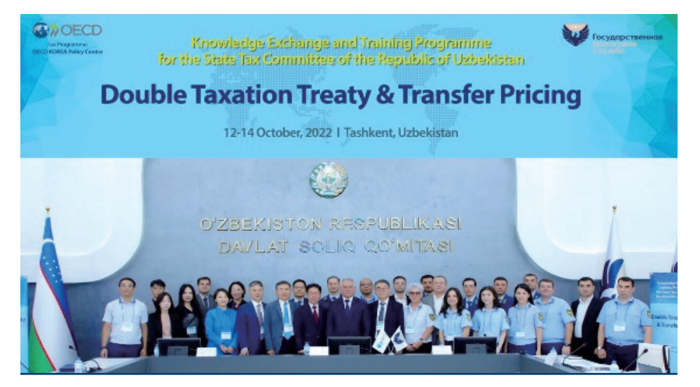
<Uzbekistan's Tax Committee(STC) Knowledge Exchange and Training: Tax Treaty and BEPS> Oct 12-14, 2022, Tashkent, Uzbekistan