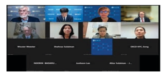
<The 13th Competition Law Seminar for Asia-Pacific Judges> Sep 18, 2023, Virtual

The Competition Law Seminar for Judges aims to provide judges in the Asia-Pacific region with an opportunity to explore the fundamentals of economics for competition law in order to elevate the understanding of judges in handling competition law-related cases, assisting them in adjudicating such cases