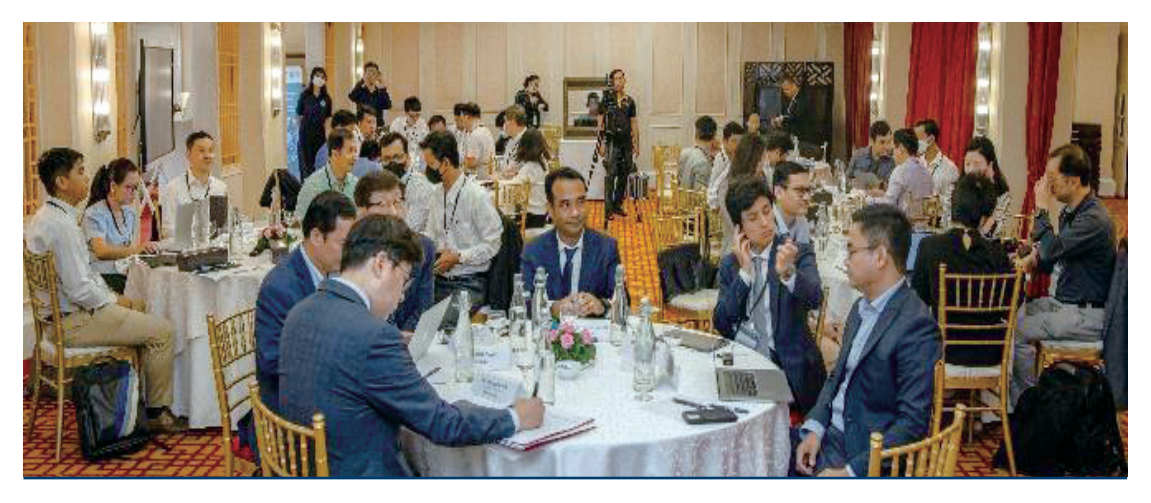
<OECD Capacity-Building Programme> May 22-23, 2023, Phnom Penh, Cambodia