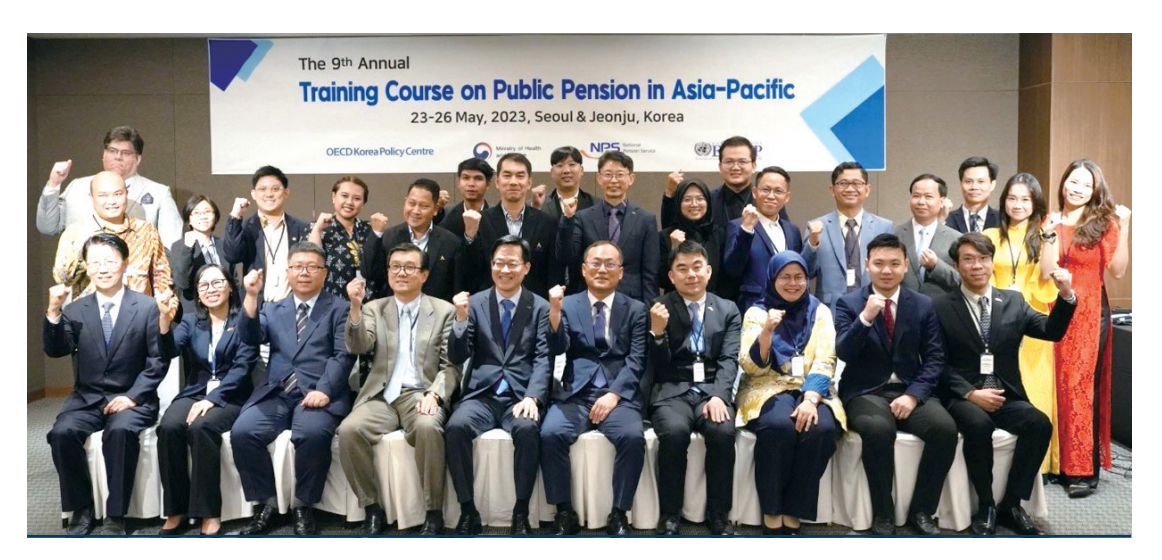
<The 9th International Training Course on Public Pension in the Asia-Pacific> 23-26 May, 2023, Seoul