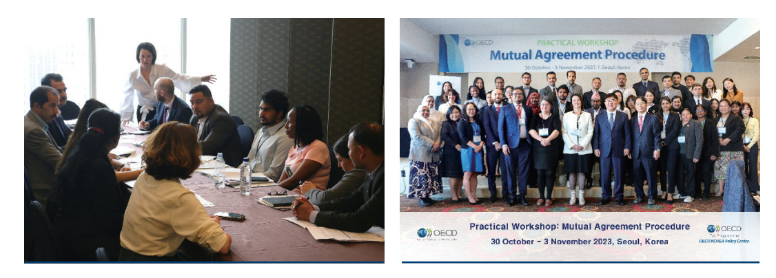
<OECD International Tax Seminar: Mutual Agreement Procedure (MAP)> Oct 30-Nov 3, Seoul