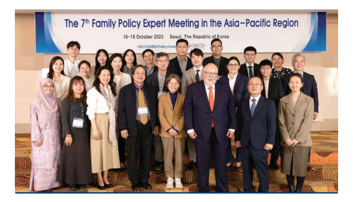
<The 7th Family Policy Expert Meetings in the Asia-Pacific Region> Oct 18-19, 2023, Seoul

The International Expert Meetings on Health/Social/Pension/Family Policy disseminate the OECD's policy trends, experiences, and guidelines for producing indexes and statistical analysis in public health and social policy to experts and government officials from the Asia-Pacific countries.