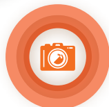
Photo Gallery p. 27

The Competition Programme of the OECD/Korea Policy Centre provides education and training to officials of Asia-Pacific competition authorities in the field of competition law and policy. This newsletter includes information about our work and the work of the OECD, as well as news, case studies and reports from competition authorities in the Asia-Pacific region.