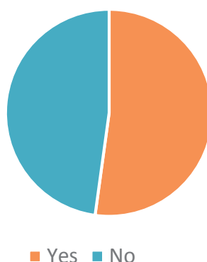
Graph 2. Many jurisdictions still have/ do not have a leniency programme

One area where there are many jurisdictions with very few cases is in the enforcement of the abuse of dominance provisions, indeed whilst abuse of dominance provisions are widespread, many jurisdictions have so far had no cases at all.