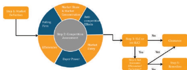
Case Study on Remedies and Commitments – Thomson/Reuters

The following diagram lists out the general steps CCS takes in its substantive assessment of mergers: