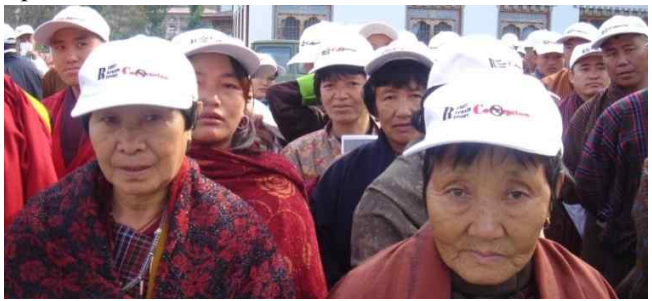
Senior citizens expressing their solidarity in building corruption free Bhutan